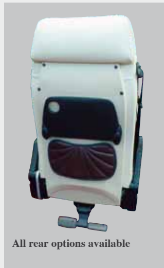
All rear options available