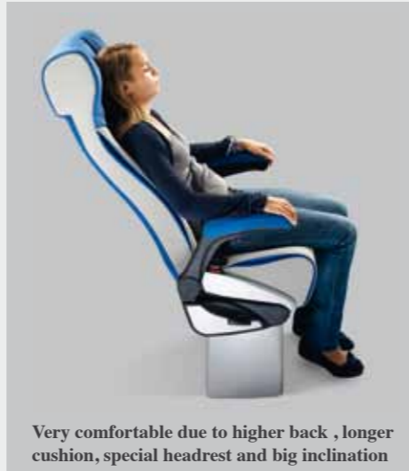
Very comfortable due to higher back , longer cushion, special headrest and big inclination