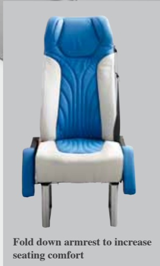
Fold down armrest to increase seating comfort